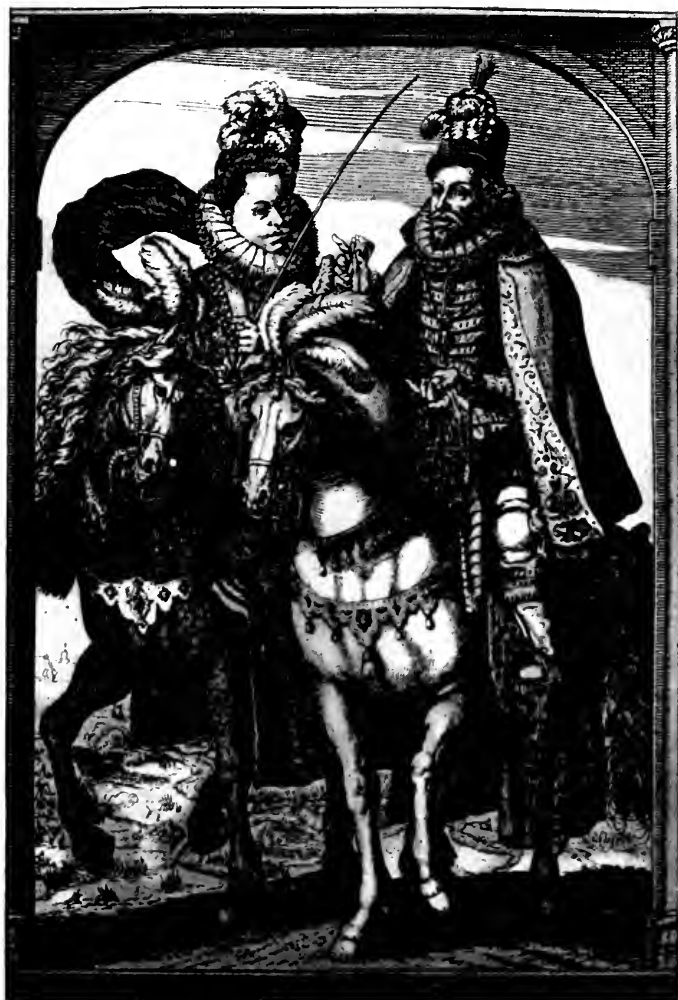
THE ARCHDUKES ALBERT AND ISABELLA